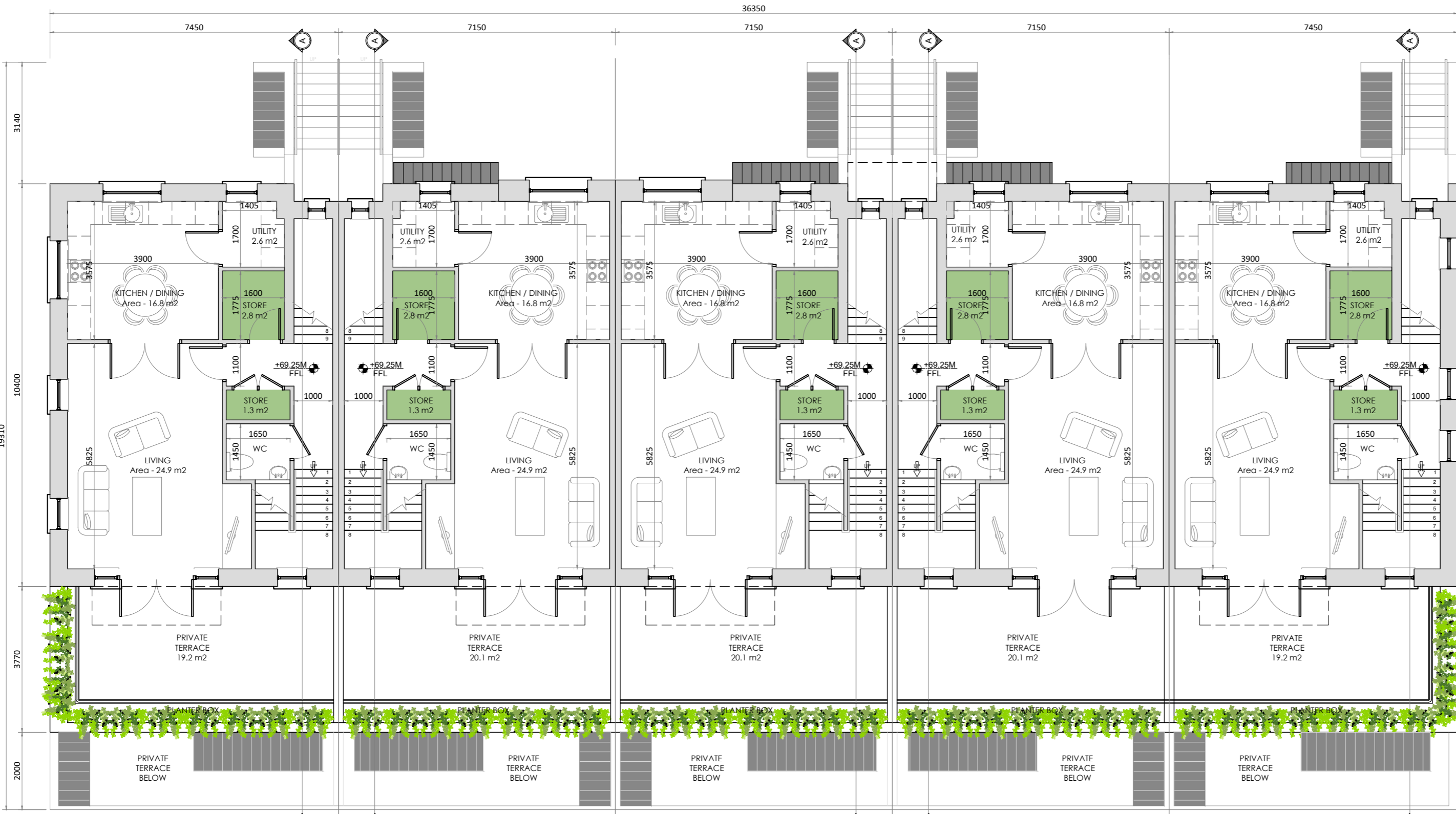
FIRST FLOOR PLAN - BLOCK B F F L - 6 9 . 2 5

Scale 1:100 @ A1 3 Bed Duplex Apt - FF Area 60.4 MSQ